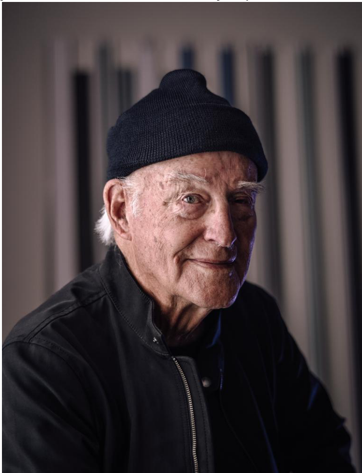
CALIFORNIA KID | 'Discovery is a very rich part of what I do,' says Irwin.

Throughout his career, Irwin has been considered a pioneer of '60s and '70s Southern California movements, like Light and Space, which extended minimalism to phenomenology, and Finish Fetish, which involved high-tech materials and super-gloss, hot-rod-like surfaces. "Bob has gone in his own direction, into the world of perception," says artist Ed Ruscha, who studied watercolor painting with Irwin in the late '50s at L.A.'s Chouinard Art Institute. "He has covered the spectrum in terms of the realms of the art world." (Irwin is also the first visual artist to have won a John D. and Catherine T. MacArthur Foundation "genius" grant, in 1984—an honor he shares with fellow Light and Space luminary James Turrell, who won it the same year.)