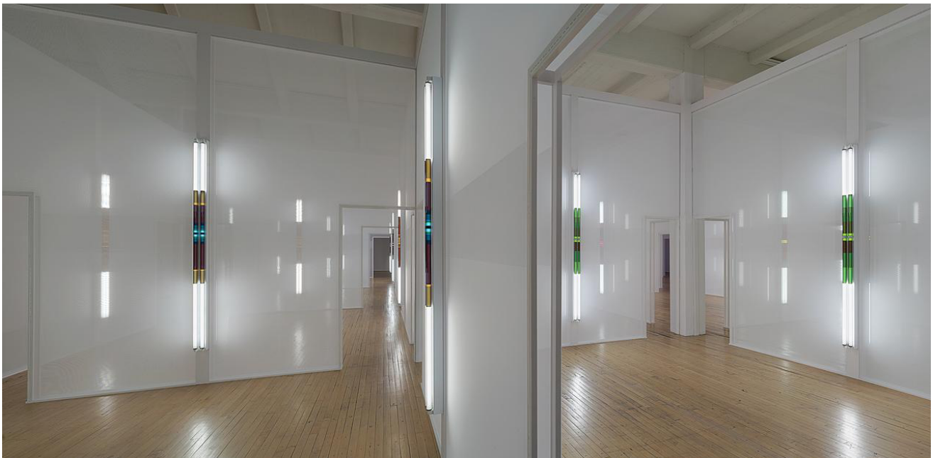
2015's 'Excursus: Homage to the Square', at Dia: Beacon, which was designed by Irwin.

The show is also the tip of the iceberg in terms of Irwin's many other projects. Up through May 2017 at Dia: Beacon is Excursus: Homage to the Square 3 , a reworking of a piece he first created for the foundation's Chelsea space in 1998. A gridded maze of chambers made from scrim, fluorescent lights and gels, the original piece filled an entire floor. The updated version has multiple exits and entrances, allowing visitors to snake back and forth, as if exponentially expanding the spatial possibilities implied by the title. "With these works, Bob's actually pointing at something much larger," says Jessica Morgan, Dia's director, "which is an ability to have an awareness of our environment."