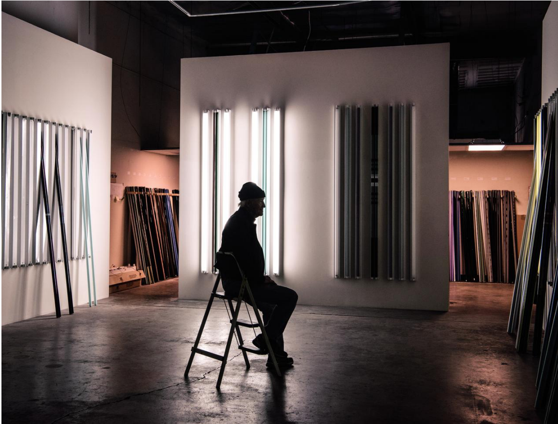
MR. LIGHT | Robert Irwin in his San Diego studio with works in progress. 'He has covered the spectrum in terms of the realms of the art world,' says his former student, the painter Ed Ruscha.

With multiple works on display at the Hirshhorn Museum and Sculpture Garden in Washington, D.C., the Dia: Beacon in New York and a 13,000-square-foot installation in Marfa, Texas, 15 years in the making, the 87-year-old artist shows no signs of slowing down