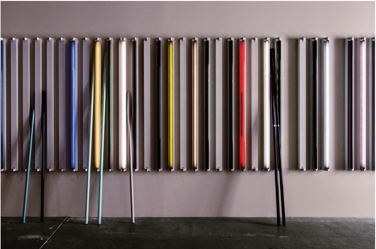
Irwin's San Diego studio

"Bob put every obstacle in my way of bringing him together with the public," says Arne Glimcher, the founder of Pace Gallery, which started representing Irwin in 1966. "He felt the work was so specific to the viewer and the object and the room that he wouldn't allow us to photograph it." Whenever Glimcher could persuade Irwin to do a show, the work would sell—but usually to private collectors rather than museums. "It would always be a big success, but it would go into obscurity," say Glimcher. In 1968, when Artforum pirated a photo of an Irwin disc piece and ran it on the cover, Irwin was outraged, but "it was the best thing that could have happened," Glimcher says. "We pretended to be outraged too, but we were delighted."