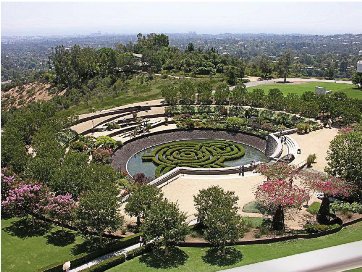
Irwin's Central Garden at L.A.'s Getty Museum

ALTHOUGH IRWIN has spent much of his career making work elsewhere, he has always been anchored in Southern California. Born and raised in Long Beach, he speaks of his youth as a happy-go-lucky time, even though his father, who worked for a utility company, lost everything in the Depression, just after Irwin was born. In his memory, it was filled with fast cars, girls and endless refills of Coca-Cola. (He's renowned for his connoisseurial appreciation of the beverage.) "In New York you're supposed to be suffering," he says. "But growing up in L.A. was not like anyplace else. You got a car when you were 17, and the world was your oyster."