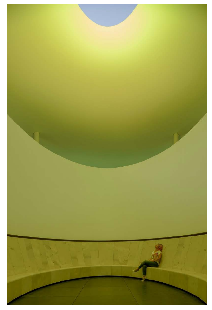
Encounter (2015). Photo: Moritz Bernoully / Copyright James Turrell

The city of Culiacán is known for its bloodred sunsets, but you'll experience them in a whole new way from James Turrell's Encounter , the first skyspace in Mexico, opened to the public in 2015. Located in the lush Botanical Gardens of Culiacan in Sinaloa, Mexico, this skyspace has a unique elliptical shape which, when viewed from above, resembles the shape of an eye. All of James Turrell's skyspaces are designed to be a space for introspection, so it's always advised to experience the space in silence. And in this particular one, surrounded by more than 1,600 plant species, it's also recommended to bring insect repellant.