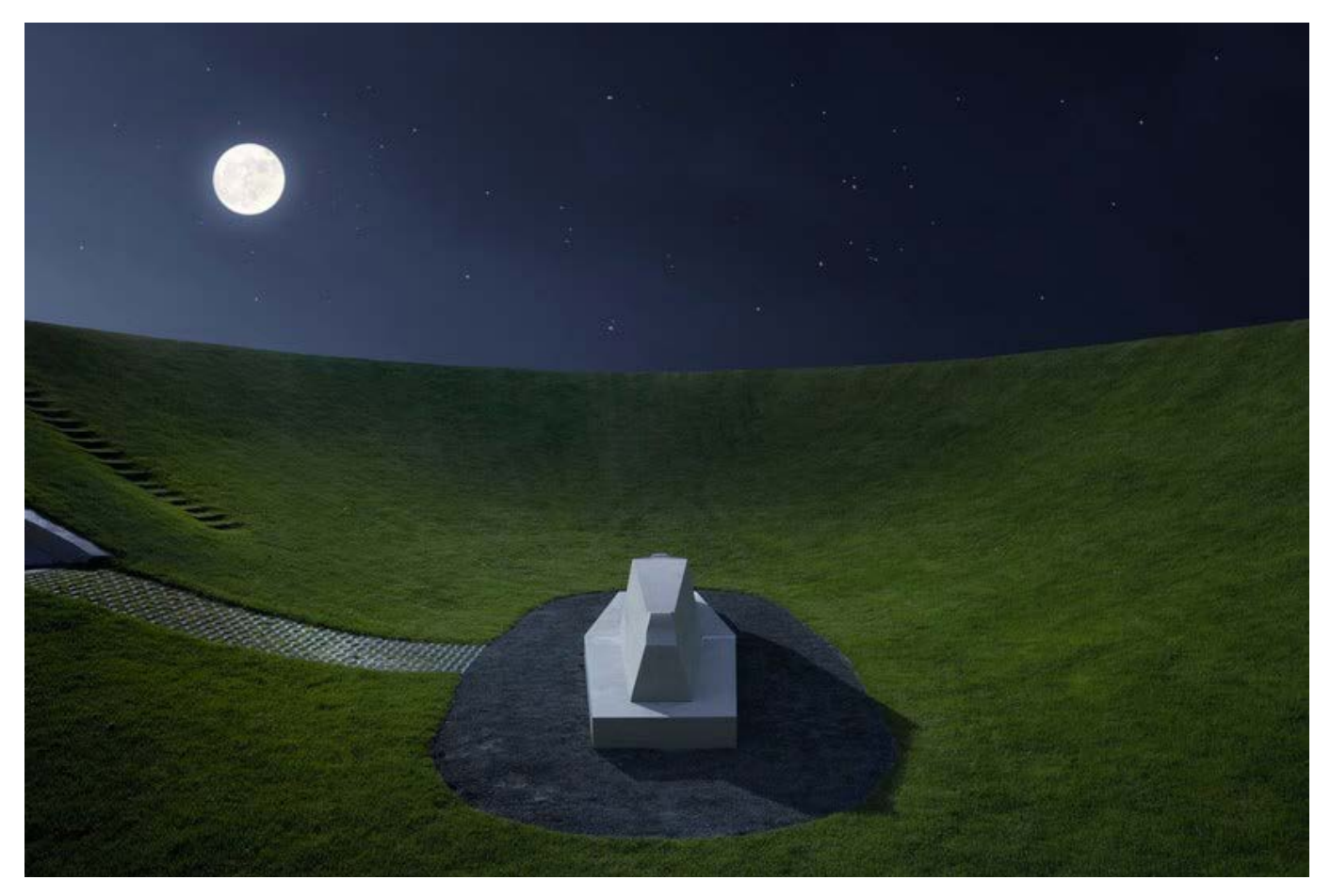
Celestial Vault (1996). Photo: Jannes Linders / Courtesy of Stroom Den Haag / Copyright James Turrell

Designing an artificial crater in the dunes of the Netherlands might have seemed like a daunting feat, but not for the master of light (and see below for Turrell's most ambitious work yet within the Mother Nature-made Roden Crater). Built in 1996, James Turrell's Celestial Vault is described not as a sculpture in the landscape, but as a tool to look at light and color. And this tool is expansive—30 meters wide and 40 meters long—creating an optical illusion of a domed sky. To reach the crater, visitors must climb stairs on the dune and then walk through a tunnel leading to an expansive grassy crater with an altarlike stone bench in the center. Lying on the bench, visitors can gaze at the crater's curved edge meeting the open vaulted sky above.