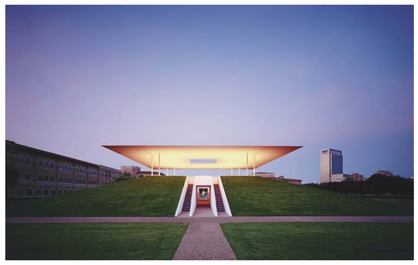
Twilight Epiphany (2012).

Is it a spaceship or is it a James Turrell skyspace? Both are characterized by out-of-this-world encounters that cannot be identified or explained. On the grounds of Houston's Rice University lies the otherworldly Twilight Epiphany , one of Turrell's largest skyspaces in the world—it can seat up to 120 people on two levels. Just before sunrise and sunset an LED-light sequence is projected onto the pyramid pavilion's 72-foot square roof and aperture in the ceiling, creating a light show that plays with the changing colors of the sky during dawn and twilight. Besides showcasing daily symphonies of light, this skyspace is also acoustically engineered to host musical performances.