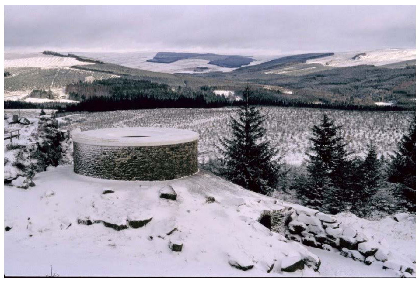
Cat Cairn (2003). Photo: Florian Holzherr / Copyright James Turrell / Courtesy of Kielder Water & Forest Park

Far from the trappings of modern life, in a remote English village surrounded by thick woods, you can be fully immersed in nature—and a James Turrell light show. On the English border near Scotland lies the Kielder Forest Park , a 500-square-mile area of rugged forest, hiking trails, and large contemporary sculptures, including James Turrell's Cat Cairn: The Kielder Skyspace . While entering the circular stone structure through a tunnel in the hillside conjures Neolithic times, the recently refurbished LED lighting sequence inside the chamber—fused with the changing sky at dawn and dusk—is nothing this world has seen before.