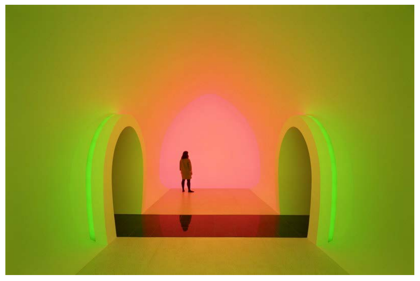
Ganzfeld: Double Vision (2013). Photo: Florian Holzherr / Courtesy of Ekebergparken / Copyright James Turrell

In Norway, a country that is known for its surreal light shows from Mother Nature—both the Northern Lights and the midnight sun—it's only fitting to experience art from the master of light himself. Ekebergparken's Sculpture and National Heritage Park in Oslo is home to two of Turrell's site-specific light installations— Ganzfeld: Double Vision (2013) and the skyspace The Color Beneath (2013). "Ganzfeld" is a German word that describes the phenomenon of perceptual deprivation, an experience that Turrell often experiments with. A trained pilot, Turrell would be familiar with the effects of navigating dense fog or a whiteout. With Ganzfeld: Double Vision , he evokes that same wonder with his signature color-out—filling a field of vision with one solid color.