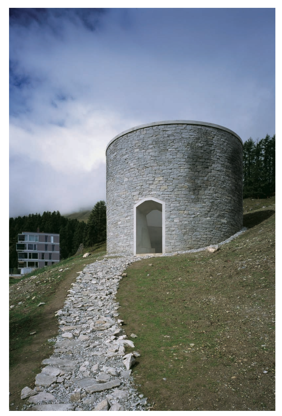
Piz Utèr (2005). Photo: Florian Holzherr / Courtesy of Hotel Castell / Copyright James Turrell

A former alpine sanatorium in a traditional Swiss village? It's just the sort of unexpected place to be fitting for a James Turrell skyspace. Built in 1913, this sanatorium-turned-art-hotel today offers an impressive collection of contemporary art, including paintings, sculpture, permanent exhibitions, and regular "Art Weekends." But Turrell's skyspace Piz Utèr (2005) is what really draws in the art seekers to this castlelike estate. The rotunda stone skyspace showcases the changing mountain skies, best experienced in contemplative silence and taken with a dose of fresh Swiss Alps air.