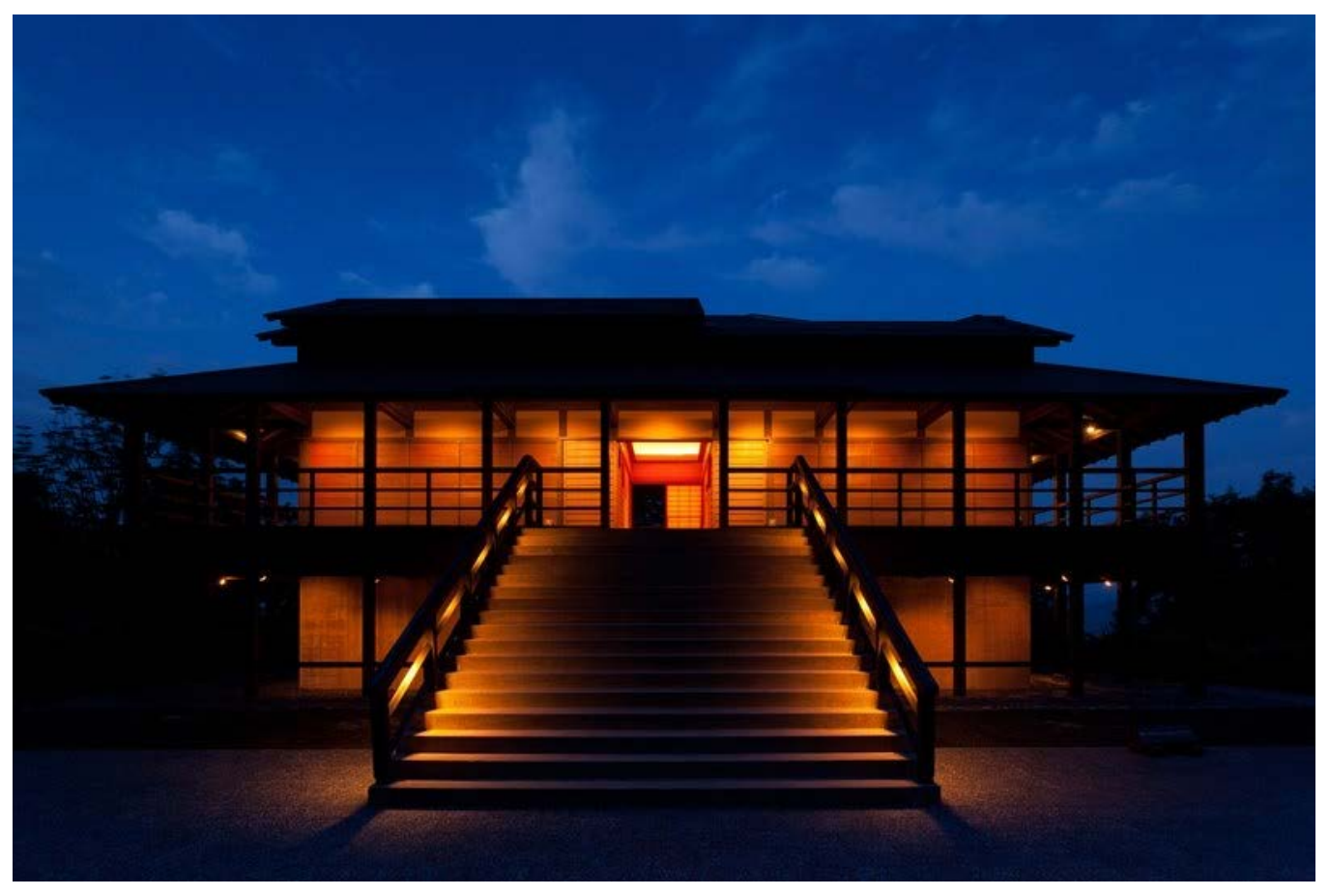
House of Light (1997). Photo: Florian Holzherr / Copyright James Turrell / Courtesy of House of Light

The power of James Turrell's art is that it evokes and expands contemplative states within the viewer. So what could be a more fitting home for his art than a guesthouse for meditation deep within Japan's rural western countryside? Guests can stay overnight at the House of Light , where Turrell has fused aspects of traditional Japanese architecture, aesthetics, and culture with his own play on light and shadows. For instance, the Japanese restorative practice of "forest bathing" can be experienced in the home's Light Bath, where guests can bathe in a tub illuminated at night by fiber optics and by day by natural light seeping in from views of the surrounding forest.