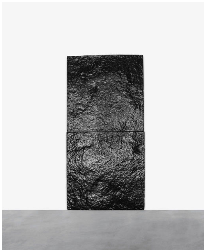
Untitled (Black Earth Series) , 1978, Mary Corse, ceramic (two tiles), 243.8 x 121.9cm (overall). Collection of the artist

Corse began experimenting with shaped canvases, including Octagonal Blue, in which she mixed metal flakes into her acrylic paint, anticipating her later work with glass microbeads. The following year, vertical bands appear for the first time in paintings such as Untitled (White Diamond, Positive Stripe) , a device that Corse still employs in her work (Fig. 5). 'The vertical bands,' she says, 'relate to you, rather than nature which is the horizon, horizontal.'