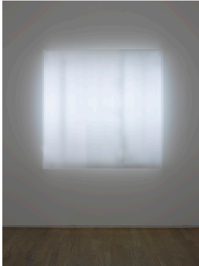
Untitled (Electric Light) , 1968/2018, Argon, Plexiglas, high frequency generator, light tubes, monofilament, 125.4x 125.4x 15.2cm

Corse becomes excited as we move around the paint-ing; one moment she is encouraging me to look at it from the side, at which angle the vertical bands and the brush-strokes seem to disappear completely, and then a moment later to join her near the window. From a few feet away, certain sections seem brilliantly white while others are grey; stepping back further, the contrast switches. As I change my position, her large gestural brushstrokes ripple across the surface, emerging and receding. Unsatisfied with the lighting, Corse switches off the studio lights and lowers the blinds on the windows, then plugs in a tungsten lamp. 'See how it changes!' she exclaims. 'Look from over here.' No longer grey and white, the painting has become a shifting palette of yellows, greens and blues. This is why still photographs cannot do justice to the fugitive and changeable nature of Gorse's paintings.