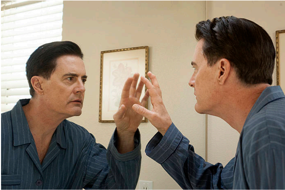
Kyle MacLachlan in 'Twin Peaks'

"[Only meditation] can really change collective consciousness and bring about a peaceful world," Lynch adds, before standing to depart. He is off to show his wife (his fourth) and five-year-old daughter (45 years younger than his eldest child) his grandparents' old house in Brooklyn.