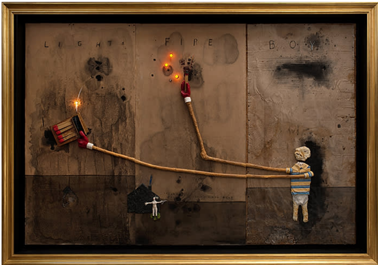
'Boy Lights Fire' (2010) by Lynch