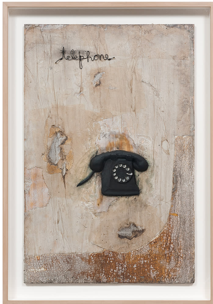
Lynch's 'Telephone' (undated) © Courtesy the artist and Kayne Griffin Corcoran

Lynch often blurs the line between painting and sculpture by building out the canvases with three-dimensional elements. "I like to cut in, too," he says. "Sometimes I put holes in the things." A photographer and printmaker as well, he's currently making lithographs in homage to Fellini's seminal film 8½ .