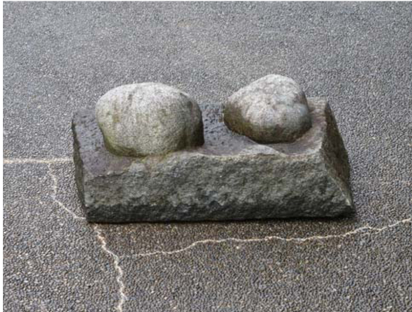
Tatsuo Kawaguchi, Existence–Stone or Stones (1974), (installation views)