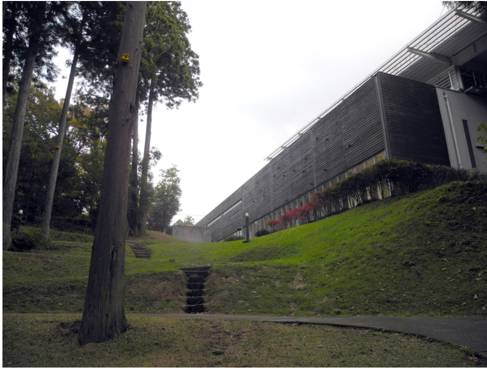
Kanaz Forest of Creation, as seen from a nearby walking path

Kanaz Forest of Creation is an excellent example of an art institution that beautifully and elegantly bridges the gap between art and nature. A must see if you happen to be traveling through the city of Awara in Fukui Prefecture, where you will experience a 'rebooting of the spirit' that only the right combination of inspiring creativity and the serenity of an unspoiled forest can produce. There are works here placed in intimate clearings such as Kimio Tsuchiya's 2005 Hidden Pyramid , a three-sided mound comprised of a variety of materials that is slowly and quietly being reclaimed by nature. You can read this work as a metaphor for any previous civilization that had achieved great wealth and power, only to fall over time to the winds of change. Or, it can be seen as a reminder that no matter how well we build something with steel and concrete, that there is no such thing as permanence when faced with the will of nature. Then there is the fallen tree that was mindfully carved by Shigeo Toya in 2000. Seen as a substantial sculpture left along the sinuous path to the nearby lakes, this delicately shaped object is a constant reminder that anything can be re-imagined, repurposed, resurrected or made anew if only we take the time to open our minds.