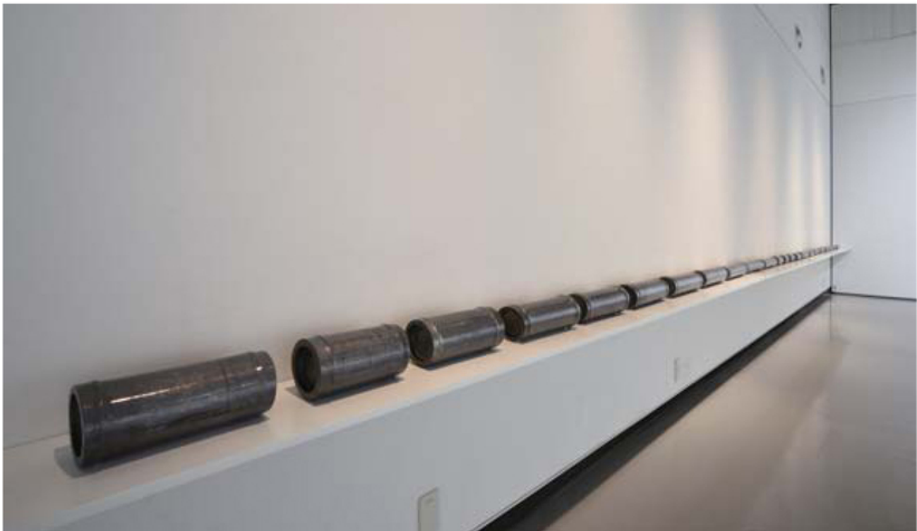
Tatsuo Kawaguchi, Darkness in Bamboo (2015), (photo courtesy of Kanaz Forest of Creation)

Darkness in Bamboo is installed on a long white shelf that runs along the one remaining wall of the Relation–Small Darkness of the 1450 days installation. Darkness in Bamboo is based on the experience of the Great East Japan Earthquake and Tsunami of 2011, when vast amounts of bamboo washed up on the beach near the artist's studio. Like the sealed boxes in Relation–Small Darkness of the 1450 days , the various naturally closed segments of the displaced bamboo forms an air-tight barrier, while its numerous joints inevitably contain darkness. Seeing these sections on Kujukuri-Hama Beach, Kawaguchi presumed the air inside each segment of bamboo had not been contaminated by the fallout from the Fukushima disaster. In this instance, the sealed darkness becomes clean air and, representing by default, a giver of life and not a metaphor for an end or death.