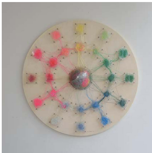
Tatsuo Kawaguchi, Interrelation (1965)

On a lighter note, it is a great privilege to see some earlier pieces, most notably Work 65-32 (1965) that brought a smile and a sense of mischievousness to the exhibition. From 1967 there is Interrelation that shows an approach to art making that has tinges of Pop Art and Abstract Expressionism while adding a nod to science, space travel and technology in general.