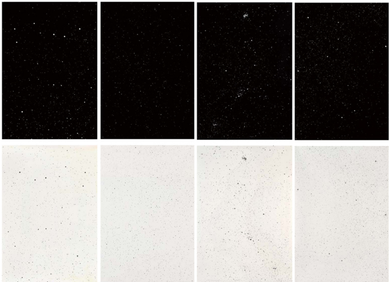
Tatsuo Kawaguchi, Star of Light, Star of Darkness, Reversed Universe (2012)