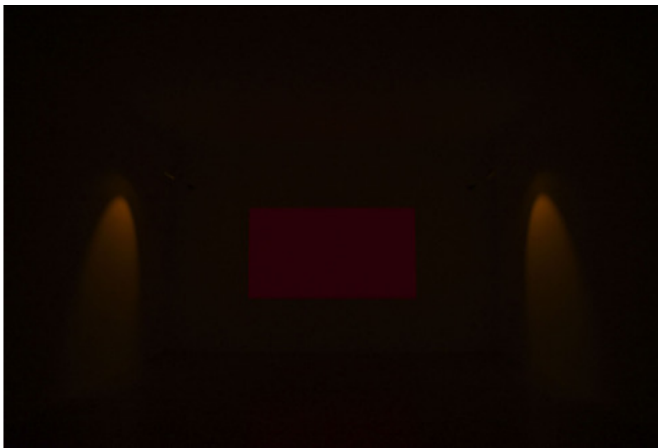
JAMES TURRELL , Space Division, Deep Breath , 1982.

Other stand out classics in this show, dating from the mid-1960s, were three "Projection Pieces" (1966–69) located in a series of bays below the staircase to the museum's second floor. Turrell created 37 variations of the "Projection Pieces" over the years. With the use of a single projector casting basic geometric forms onto an opposing corner of a room, an optical illusion occurs, creating a volume and mass floating in space. Works such as Afrum , Pale Pink (1967), a glowing, gravity-defying cube, along with Gard , White (1967), a luminous pyramid or tetrahedron, produced a minimal, pure and mesmerizing effect.