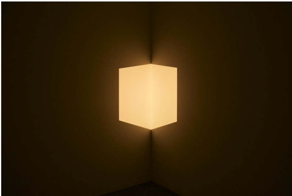
JAMES TURRELL, Afrum, Pale Pink , 1967, cross corner projection.

In Turrell's debut retrospective exhibition in China, "Immersive Light" at the Long Museum in Shanghai, 15 installations of the artist's most widely recognized, tried and true ideas and works were on view. The grand centerpiece of the exhibition was Ganzfeld, Shangri La (Over the Hump) (2017), which is a large room-size, walk-in atmospheric installation with a cycle of changing colors that envelops the entire space and its visitors. Based on sensory-deprivation experiments that Turrell, along with artist Robert Irwin, and psychologist Ed Wortz conducted as early as 1969, Ganzfeld refers to the German word to describe a "complete field" or perceptual deprivation, also known as the Ganzfeld Effect. Under this phenomenon, one is exposed to unstructured stimuli or conditions as the brain tries to make sense of one's surroundings. Unable to discern physical dimensions or distance, such as the horizon, one experiences a disorienting loss of depth perception. Pilots flying in massive fog or heavy clouds can experience this; snow blindness during a blizzard also causes this effect known to induce hallucinations.