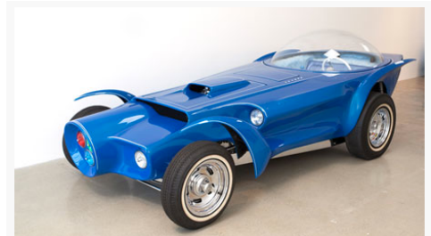
Ed Roth, "Obitron," 1960-64 Car