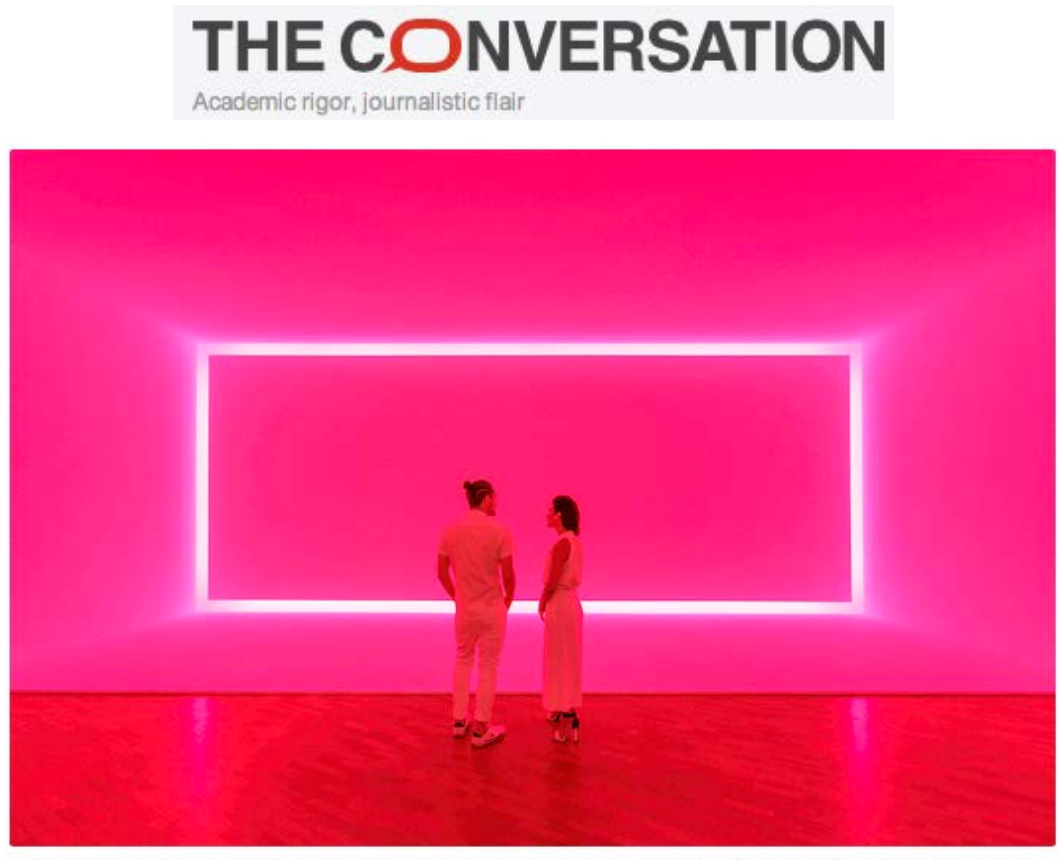
James Turrell, Raemar pink white 1969, Shallow space construction: fluorescent light, 440 x 1070 x 300 cm, Kayne Griffin Corcoran, Los Angeles, California. National Gallery of Australia

Grishin, Sasha. "Experiments with light: James Turrell dazzles at the NGA." The Conversation. 7 January 2015. Web.