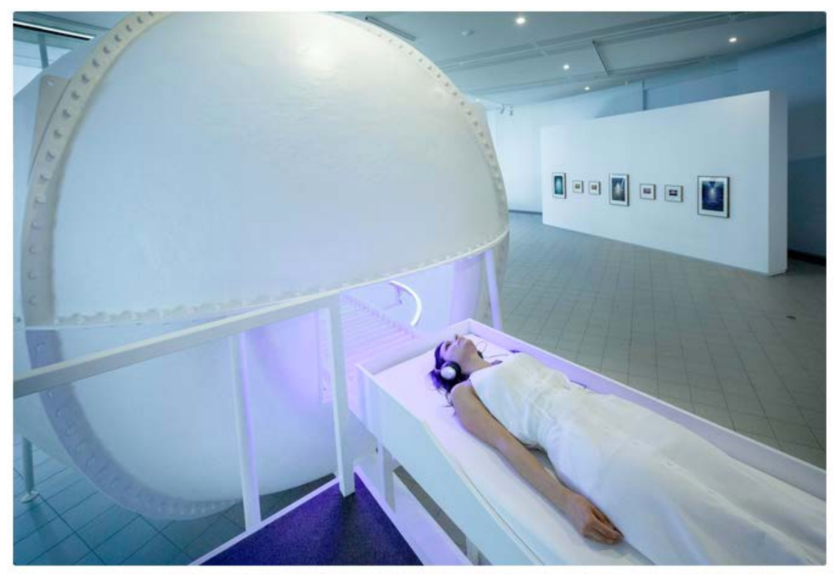
James Turrell, Bindu shards 2010, Perceptual cell: fiberglass and metal. Light program, 420.8 x 653.1 x 607.1 cm (sphere), National Gallery of Australia, Canberra, purchased 2014. National Gallery of Australia

For the next 11 minutes you are bombarded with constantly changing flashing patterns of stars, crystals, galaxies, quasars and nebulae. Within a couple of minutes you are completely disorientated losing any sense of physicality and you start to float as if on a cloud and enter into a state of deep meditation.