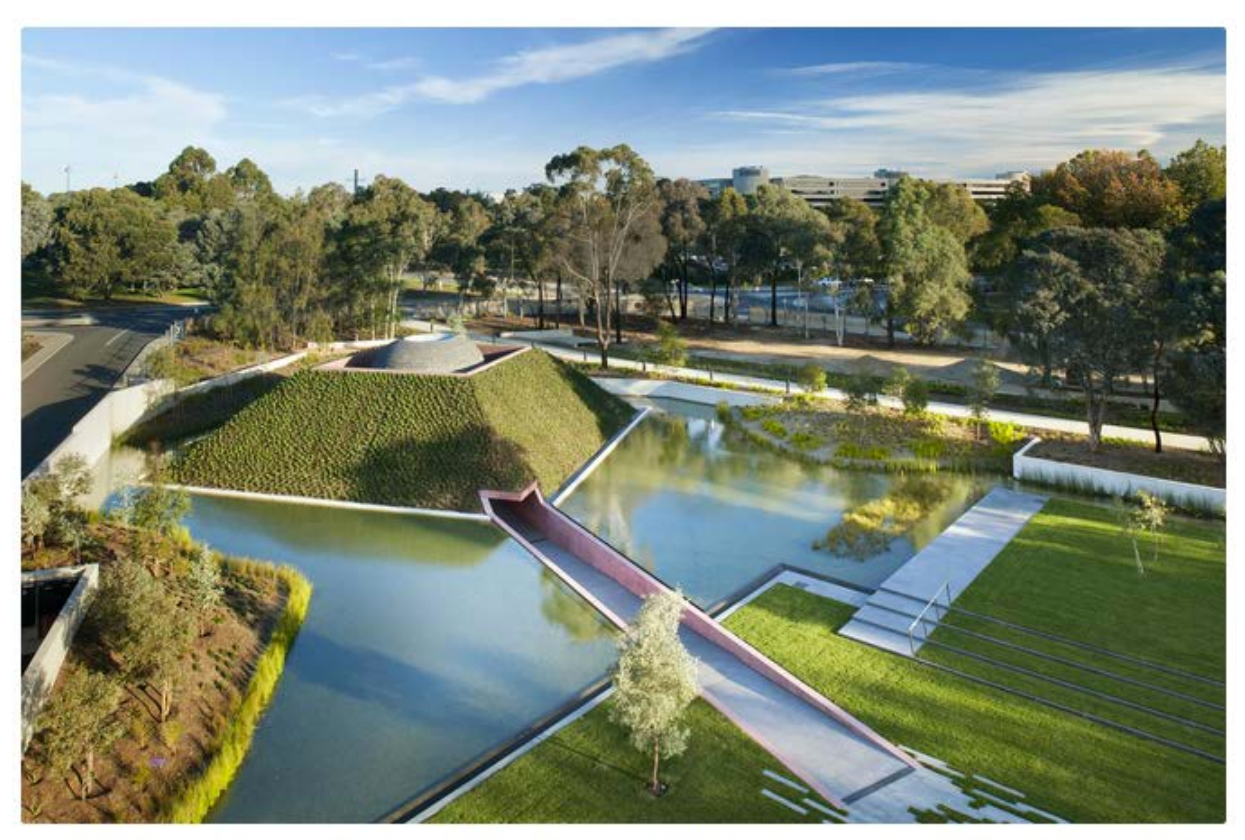
James Turrell, Within without 2010, Skyspace: lighting installation, concrete and basalt stupa, water, earth, landscaping, National Gallery of Australia, Canberra. G James Turrell

opening up to the sky with a moonstone set into the centre of the floor reflecting the oculus opening above. From here the viewer can contemplate the heavens which appear particularly dramatic at dawn and at dusk.