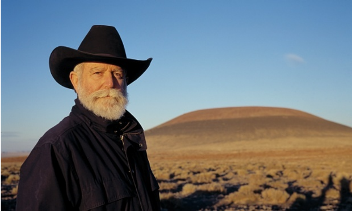
James Turrell in front of Roden Crater at sunset.